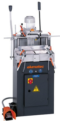
1-spindle copy router AS 70/44